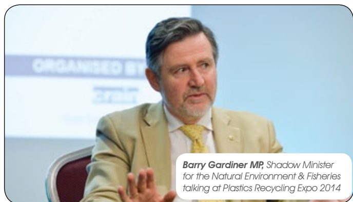
Barry Gardiner MP , Shadow Minister for the Natural Environment & Fisheries talking at Plastics Recycling Expo 2014

PRS will host the Plastics Recyclers Europe's (PRE) Working Group meetings. PRE represents approximately 80% of European mechanical recycling capacity and has over 115 members from all over the EU. PRE's mission is to promote plastics recycling in Europe and to create a good business climate for plastics recyclers. There are 8 Working Groups within PRE which represent particular interest groups - depending on the type of the polymer or type of waste processed: Crates & Pallets, ELV, HDPE, LDPE, Mixed Plastics, PET, PVC and WEEE. The Working Group meetings gather around 100 plastics recyclers. There will also be a conferences on the exhibition floor.